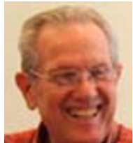
Rodrigo Carazo, (Costa Rica) Former President of Costa Rica from 1978 to 1982, and founder of the University for Peace.