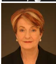
Dr Helen Caldicott (Australia) Physician, environmentalist, and campaigner against nuclear power and nuclear weapons.