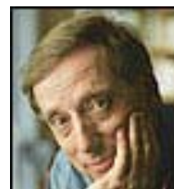
Ariel Dorfman (Chile) Writer (playwright: Author and human rights activist.