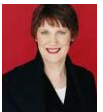
Helen Clark Former Prime Minister of New Zealand from 1999 to 2008.