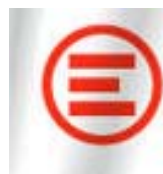
Emergency (Italy). Provides free, medical and surgical treatment to the victims of war, landmines and poverty.