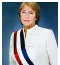
Michel Bachelet (Chile) President of Chile