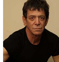
Lou Reed (USA) American rock musician best known as the guitarist, vocalist and principal songwriter of The Velvet Underground.