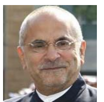
Jose Ramos Horta, President Timor Leste and Nobel Peace Laureate