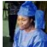
Juli Endee, popular singer of West Africa, peace-builder, and Cultural Ambassador (Liberia)