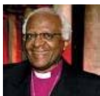
Archbishop Desmond Tutu (South Africa)