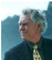
Bob Harvey (New Zealand) Mayor of Waitakere City.