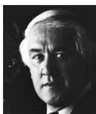
Sir Paul Alfred Reeves (New Zealand.) Former Archbishop and Primate, Former Governor-General. Currently Chancellor Auckland University of Technology.