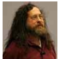
Richard Stallman (USA) Programmer international Free Software Movement