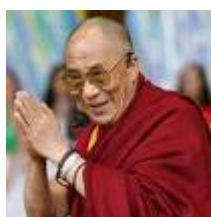
His Holiness, the Dalai Lama