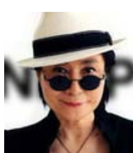
Yoko Ono (USA) Known for her Art, Music, and marriage to John Lennon.