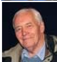
Tony Benn (United Kingdom) Labour politician