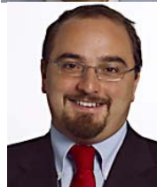
Giusto Catania (Italy) Member of the European Parliament