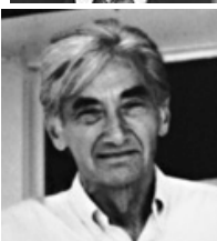
Howard Zinn (USA) Professor, political scientist, historian, social critic, democratic socialist, political activist