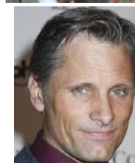
Viggo Mortensen (USA) Theatre and film actor, poet, musician, painter & photographer