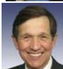
Dennis Kucinich (USA) Democratic Party Congressman