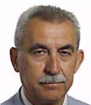
Giulietto Chiesa (Italy) Member of the European Parliament