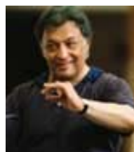
Zubin Mehta (India) Orchestra Conductor