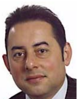
Gianni Pittella (Italy) Member of the European Parliament