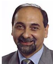
Umberto Guidoni (Italy) Member of the European Parliament