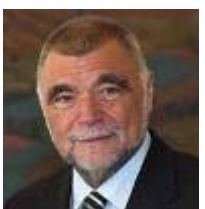
Mr Stjepan Mesic President of Croatia