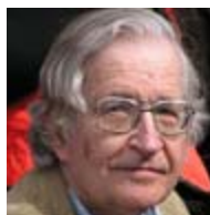
Noam Chomsky (USA) "The World March for Peace and Non-Violence is a wonderful idea".