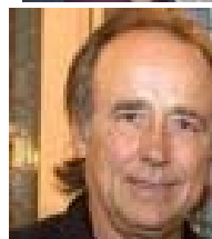
Joan Manuel Serrat (Spain) Singer, Composer, Arranger & poet.