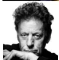
Philip Glass (USA) One of the most influential composers of the late-20th century.