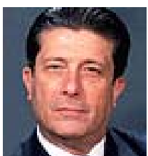
Federico Mayor Zaragoza (Spain) Former Director-General of UNESCO for 12 years. Director of Culture of Peace