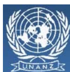
United Nations Association of New Zealand