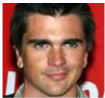
Juanes (Colombia) Singer-songwriter