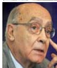
Jose Saramago (Portugal) Nobel Prize in Literature 1998