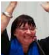
Luisa Morgantini (Italy) Vice President of the European Parliament.